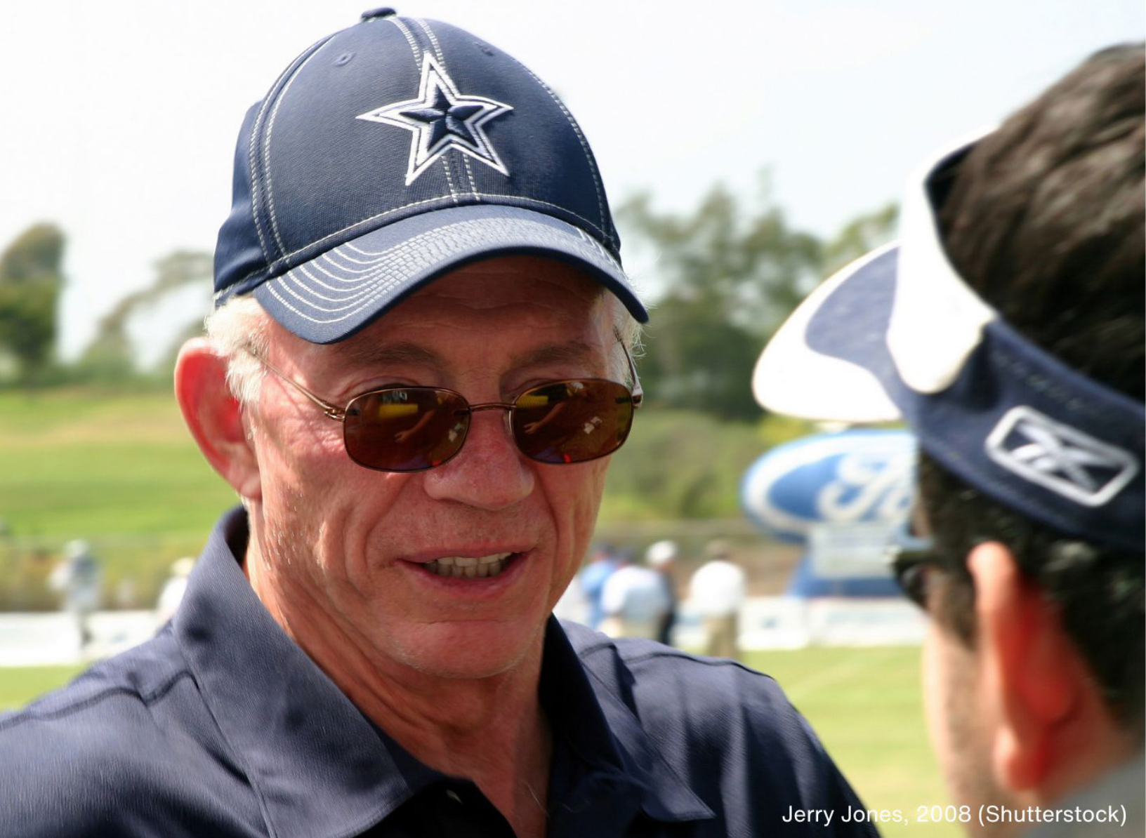
Jerry Jones, 2008